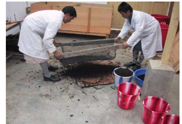
7. Sieving the processed compost (after 45 days).