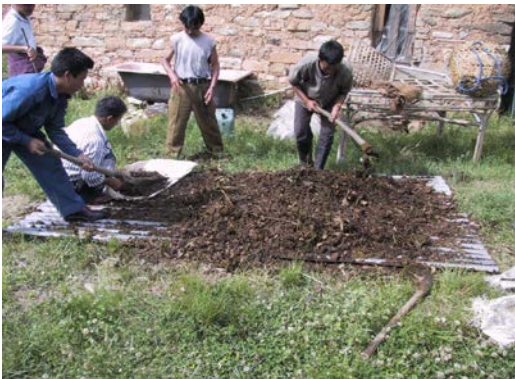
1. Cattle dung being shredded into smaller parts.

Worm casts contain five times more nitrogen, seven times more phosphorus and eleven times more potassium than ordinary soil. The casts are also rich in humic acid, which is used for conditioning the soil, having a perfect pH balance and it also contains plant growth factors.