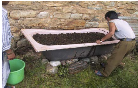
3. Tub filled, leveled and worms introduced (day 1).