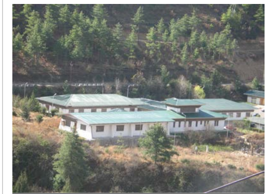
NSSC Complex at Semtokha