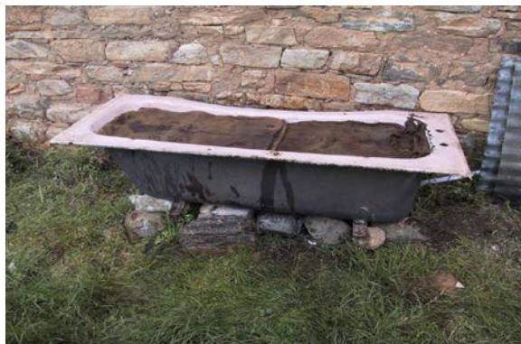
4. Covered with wet gunny bags.