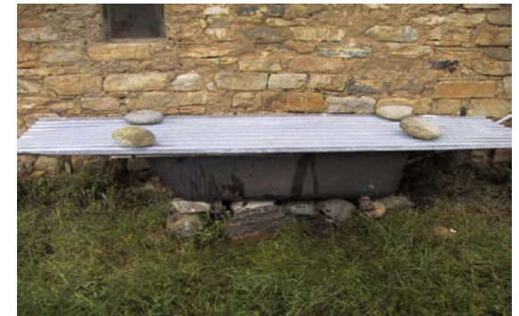
5. Protect from rain and shine.