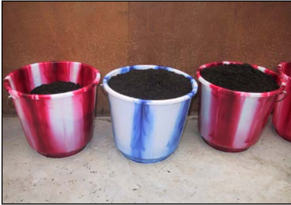
8. Processed compost