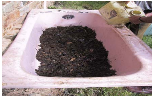
2. Spread and moistened with water.