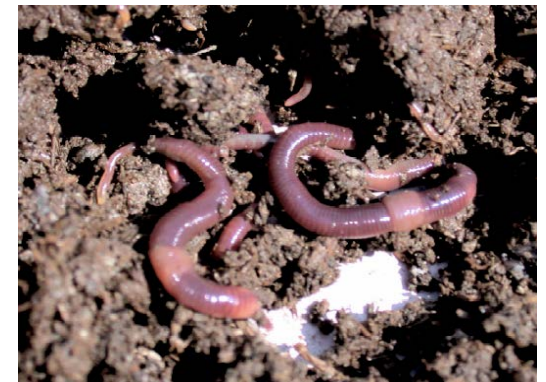
6. Worms feed and multiply.